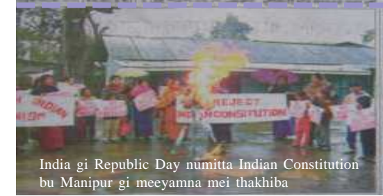
India gi Republic Day numitta Indian Constitution bu Manipur gi meeyamna mei thakhiba

Meeyamsing aduna Indian Constitution adu mei thadringei mangoinana “We want freedom”, “Down with Indian Colonism”, “We reject Indian Constitution”, “We reject Indian Constitution with Indian Colonism” haina slogan kayasu laokhi. Loinana slogan sing asi thaba banner amasung playcard sing paiduna Republic Day thouram yaningdaba autkhi. Tungda banner sing amasung Playcard sing slogan kaya laoduna mei thakhi.