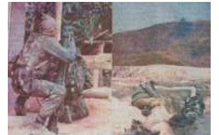
Nongmei kapnaringeida pao lounaba changsinkhiba paomeesingna Commando singga punna paktharaga leiminnaba amasung IOF ki kangbuga loinana commando

pung 6.30 rom tabadagi houraga numidangwairam pung 5 rom taba faoba matat matat nongmei kapnaxhi.