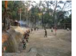
PLA gi 252 Mobile Bn. gi lanmeesingna lal ouraiba

“ATHOUBASINGNA KATTHOK-E, YAWOLNA KHUMANG CHAOSHILLI”