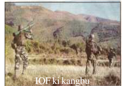
IOF ki kangbu