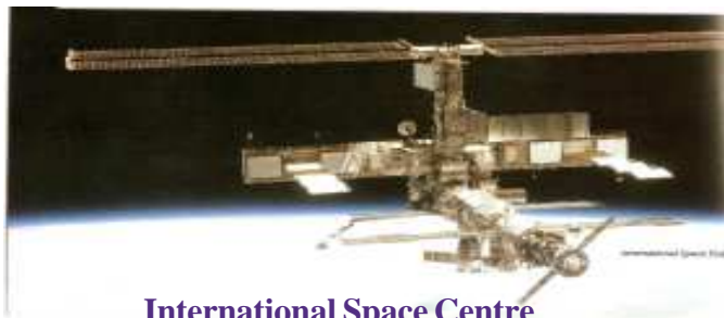
International Space Centre