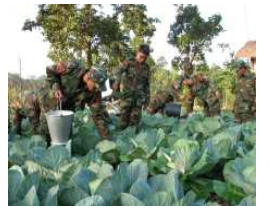
PLA gi lanmeesingna Firm No.2 da inkhol koiba

"ATHOUBASINGNA KATTHOK-E, YAWOLNA KHUMANG CHAOSHILLP"